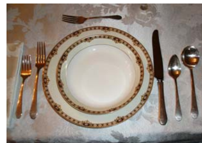
Above: Six-piece place setting of new silverware.