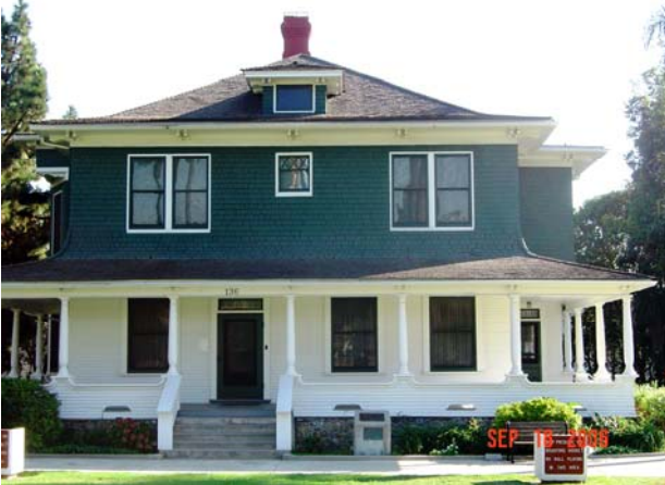
The Bradford House